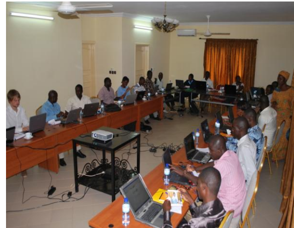
Practical session with participants