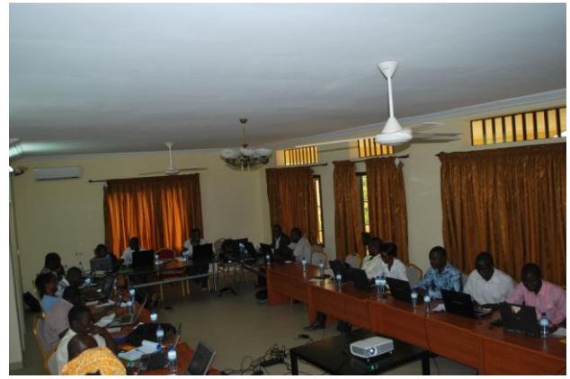
Practical session with participants