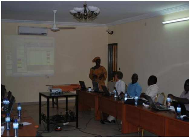
Remote Sensing session with participants

Answer: refer to the documentation on spectral theory and spectral signatures to identify an object that a picture or color represents. The second PowerPoint slide of the workshop gives the reflectance of various objects. Using reflectance, you can identify an object that a picture represents.