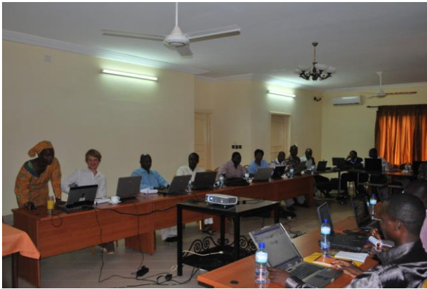
GIS session with participants

Answer: You have to read the software's help document or other documents about ArcGIS on the internet to get a functions list and learn what they can do. If you need a function now, you can find it by clicking on search and writing its name.